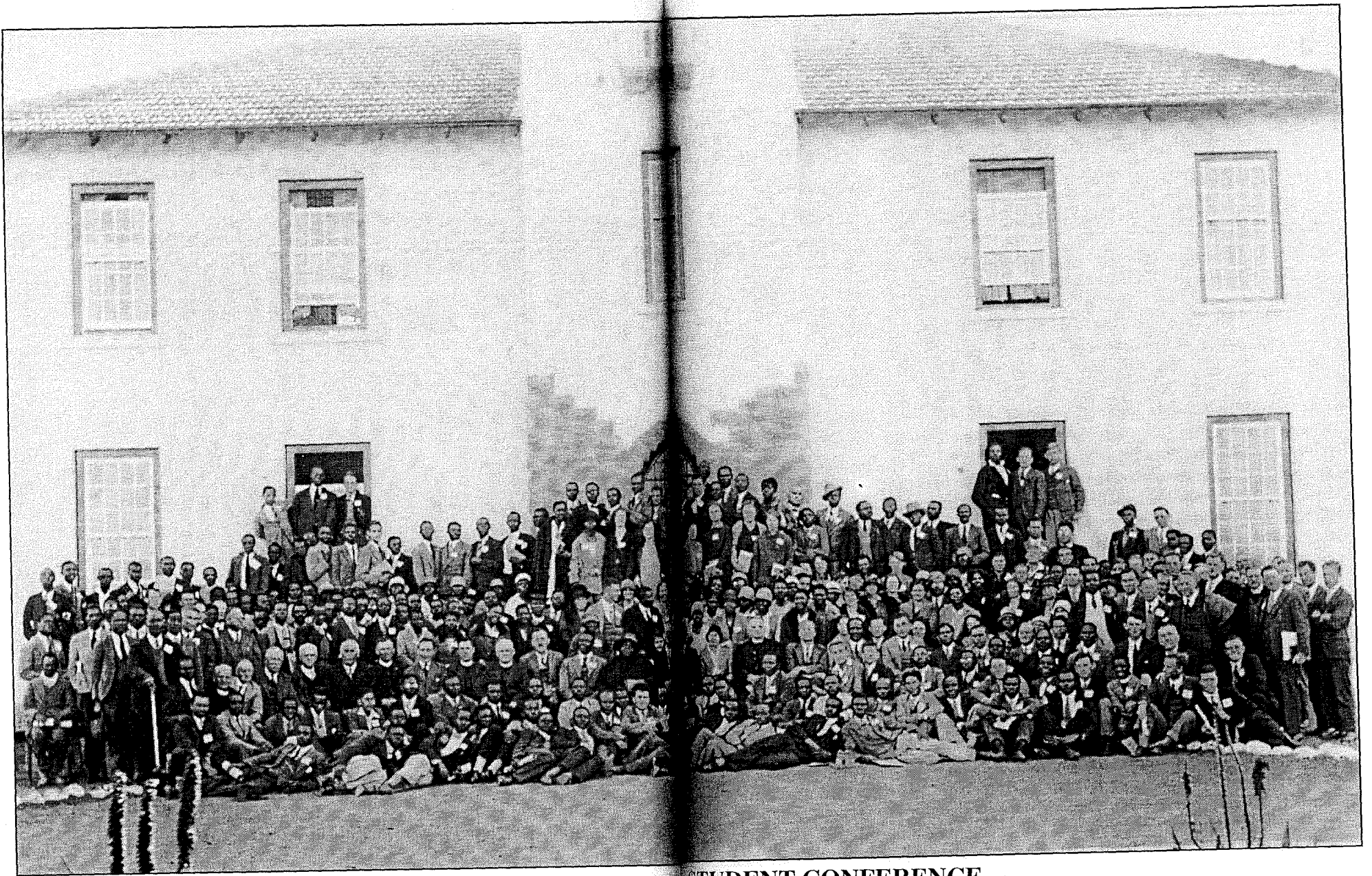
BANTU-EUROPEAN STUDENT CONFERENCE HELD AT FORT HARE June 27th to July 3rd, 1930.